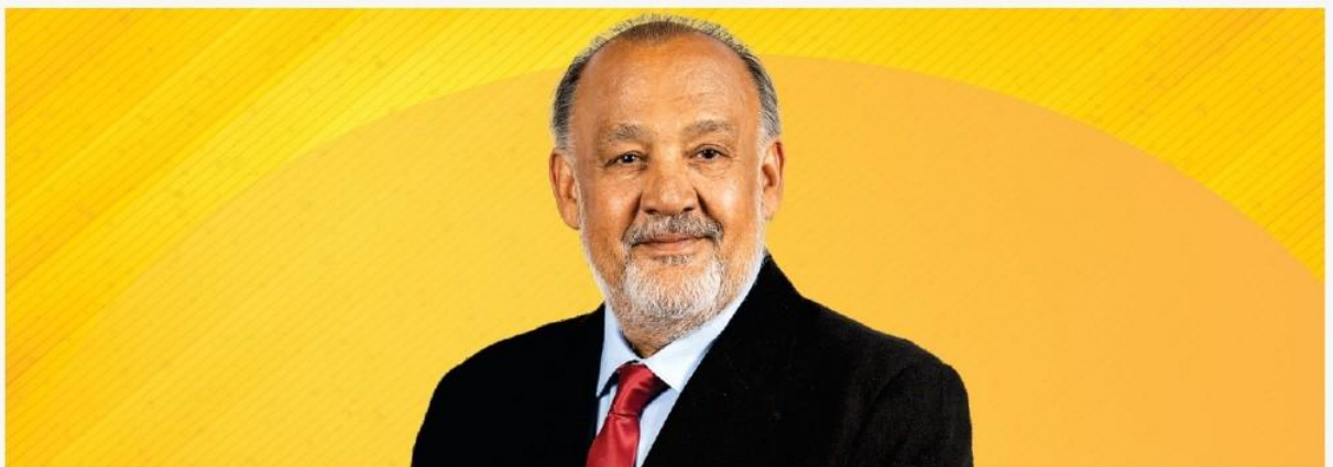
BRAND AMBASSADOR "ALOK NATH"