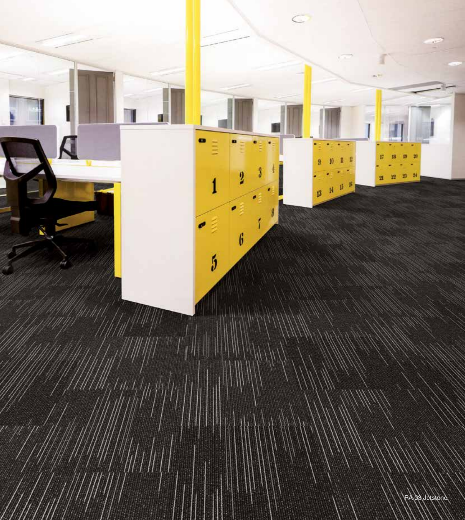
RA 03 Jetstone