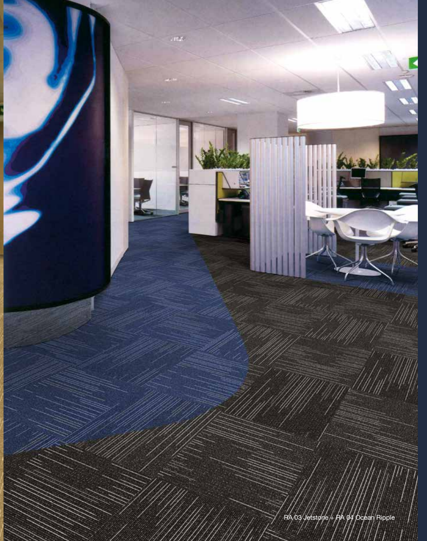
RA 03 Jetstone + RA 04 Ocean Ripple