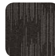
RA 03 Jetstone