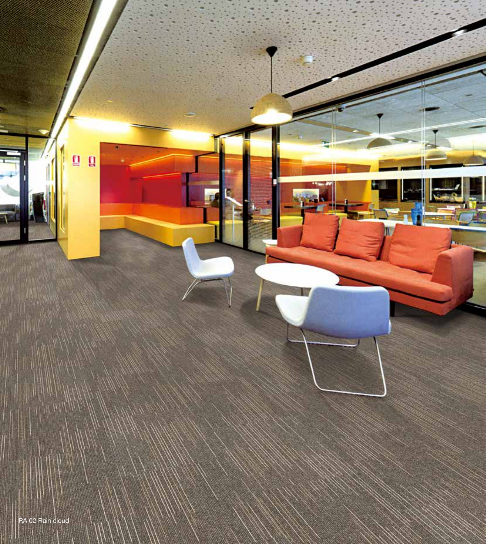
RA 02 Rain cloud