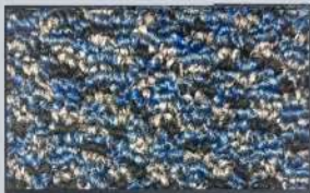
CHECKMATE - BLUE GREY