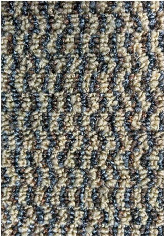
CHECKMATE - BEIGE