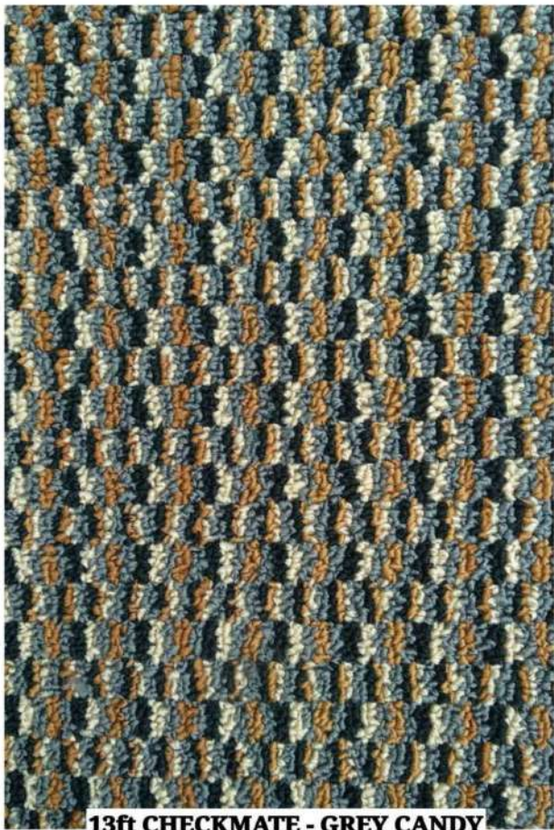
13ft CHECKMATE - GREY CANDY