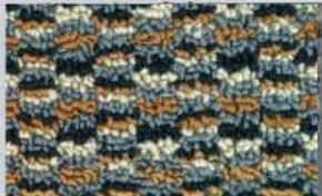
CHECKMATE - CANDY BROWN