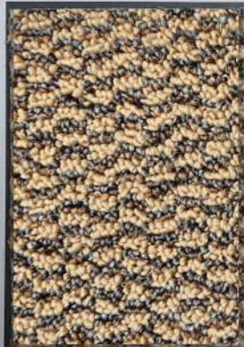
CHECKMATE - BEIGE