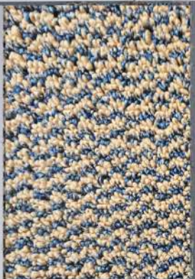
CHECKMATE - BLUE BEIGE