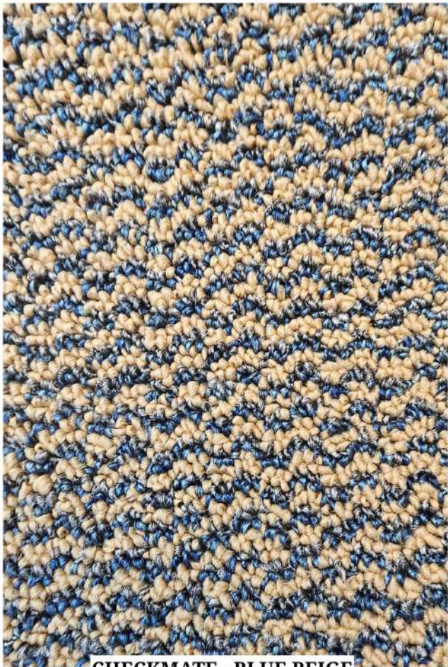
CHECKMATE - BLUE BEIGE