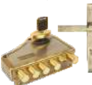
*H347 AB with Reversible Plate Handle