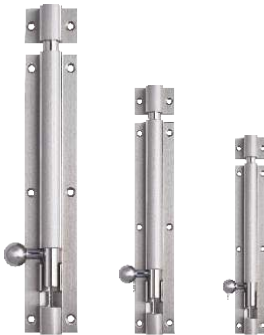
Tower Bolt : SS