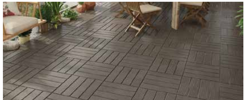
COMPOSITE DECK TILES IN CROSS HATCH PATTERN